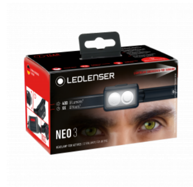
Exemplary Packaging Illustration