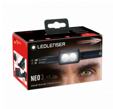
Exemplary Packaging Illustration