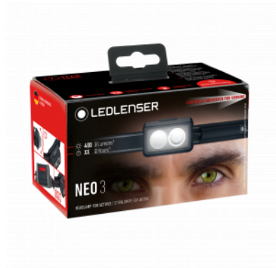
Exemplary Packaging Illustration